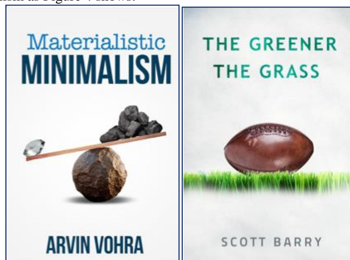
Figure 4. Minimalistic cover design for single titles: Vohra, 2017 and Barry, 2017

C.H. Beck Wissen furthermore alleviate the fear that a minimalist cover might leave no room for creativity. More than 500 different covers published C.H. Beck Wissen shows the wide range of unique cover layout alternatives even within this tight requirement on series design. But not only series, also single titles work well with minimalism as Figure 4 shows: