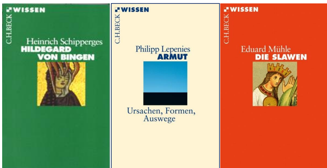
Figure 3. Cover Design of C.H. Beck series: Schipperges 2005, Lepenies 2017 and Mühle 2017.

Each of the cover elements has a meaning and is well elaborated: The chessboard element in the series name stands for wisdom, the author and title are always positioned at the same place in order to build habits with the consumers which help them to capture the topic even faster and the title is always written in upper-case letters and in bold font in order to emphasise the importance of topic before author (Gießler 2006, pp. 146-147).